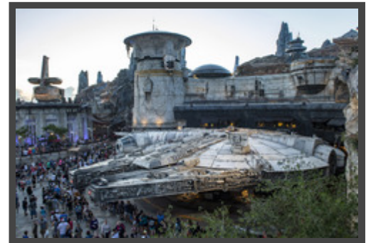
A full-size model of the famous Millennium Falcon starship is just one of the attractions at Disney's Star Wars: Galaxy's Edge.

In 2019, Star Wars fans' dreams came true with land openings at Disneyland in California and Disney's Hollywood Studios in Florida. This was after 4,000 people sweated the small stuff for five years to create these twin attractions. It was the biggest single-theme addition in Disney history. And not even the tiniest feature was overlooked. After all, Star Wars lovers are Jedi masters when it comes to the details! That's partly why the setting isn't from any of the movies, because fans know they aren't part of those stories. But on the planet of Batuu—a hot spot for traders, smugglers, and intergalactic explorers—a whole new story unfolds under its three suns.