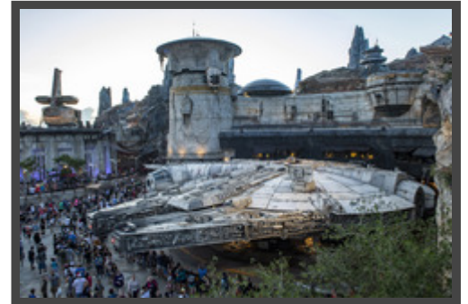
A full-size model of the famous Millennium Falcon starship is just one of the attractions at Disney's Star Wars: Galaxy's Edge.

Video credit: Courtesy Disney, with music by Valeriano Chiaravalle/proudmusiclibrary.com